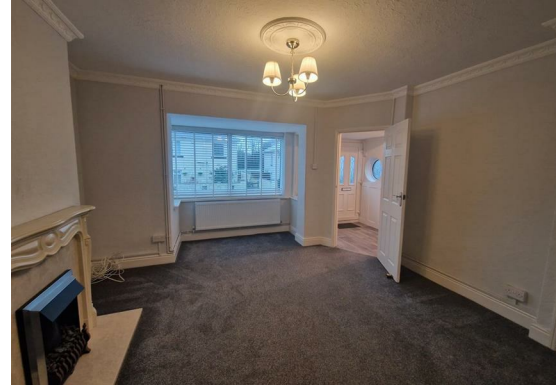
Bedroom 2 13'2" x 8'10" (4.033 x 2.715)